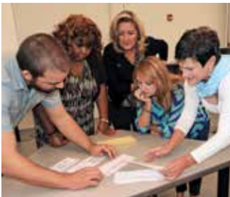
Professional Development Day..... 12-13