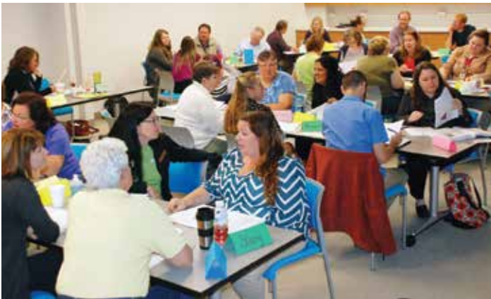
Around 40 faculty signed up for the morning or afternoon session of "Focus on Your Learners by Involving Them in the Process." A flipped course is based on reversing the design of the learning environment so you switch from instructor-centered design to participant-centered design.