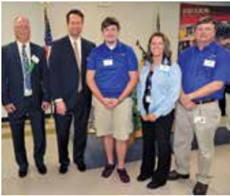
JTEKT President: "We Need What You've Got"... 6-7