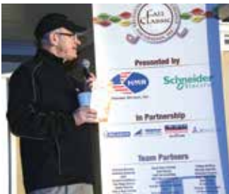
10th Annual Fall Classic.....19