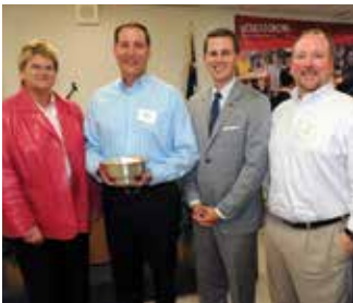
Foundation Honors Bosch ..... 9